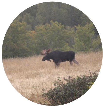
Moose, Photo Cred: A. Beauchamp

The Acadian forest habitat is where the northern Boreal Forest and the Southern Deciduous forest meet and mix, resulting in a mix of hardwood and softwood tree species. Within this unique habitat, the productive soils and a cool climate supports a diversity of wildlife and unique plant communities. The Acadian forest is