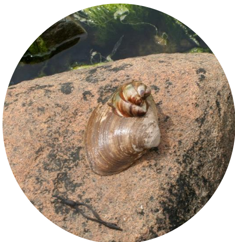
Quahog, Photo Cred: L. Minich

The hills surrounding Sam Orr's Pond were originally covered with local climactic vegetation of spruce, fir, cedar, beech, maple and birch. Today, there is a considerable second growth that has overgrown fields and clear cuts. The surrounding marsh supports dense populations of grasses and marsh plants. Wigeon sea grass, ( Ruppia marina ) and ( Zostera marina ) are the dominant pond plants while ( Fucus vesiculosus ) and ( Enteromorpha sp. ) are common in the rapids. ( Enteromorpha ) dominates the isolated ponds in the marsh.